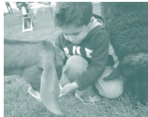
A young outdoorsman enjoys feeding the goats from Sleepy Hollow Farm at the combined Okehocking Fall Fest and Greentree Country Fair.