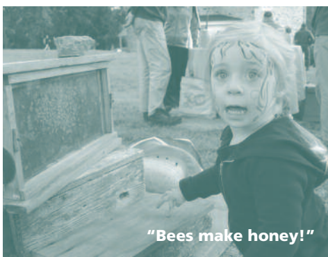
"Bees make honey!"

The Thornbury Ramblers provided a bluegrass soundtrack to the afternoon's events.