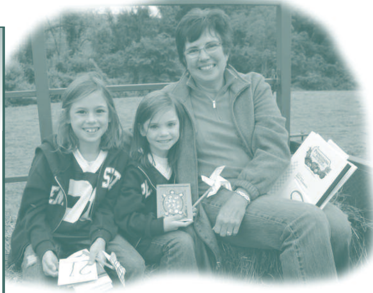
Hayrides at Okehocking are always a big hit. Guides answer questions and talk about the property, management, conservation, improvement projects, and any critters that are out and about.