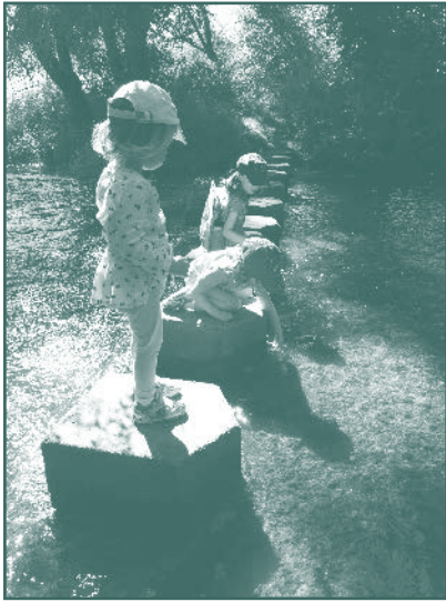
Go WilMa! outdoor adventurers pause for a moment in the stream at Ashbridge Preserve.

G O WilMa! stands for Get Outside around Willistown and Malvern! This outdoor adventure program is based on the summer reading themes for K-5 children and teens identified annually by the national Collaborative Summer Library Program (CSLP). We combine the Malvern and Paoli Library summer reading programs with GO WilMa! based upon the CSLP theme. Under the leadership of Willistown Parks and Recreation, the program team includes Malvern and Paoli Library.