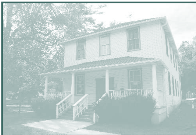
Willistown Township Administration is back on the Coxe Memorial Campus, 688 Sugartown Road, Malvern.

The renovations currently underway include an interior office space restructuring, installation of a new roof, electrical and plumbing upgrades, improvements to entrances, and, of course, a fresh coat of paint. The renovated space will include office space for administrative personnel and a fully accessible meeting room.